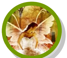
Blessing In Disguise

Blessing in Disguise creates a positive focus on enabling freedom to enjoy treasured memories to share with family and loved ones and provides a range of life enhancing experiences helping to improve the quality of life for children and young people with disabilities or life limiting illnesses.