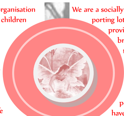
Blessing in Disguise

We are a socially responsible organisation helping and supporting lots of children and families by promoting and providing free equipment, activities and themed breaks and social and recreational opportunities for the whole family. Through personal experience, we know that it can often be difficult on other family members, who perhaps unfortunately miss out, but we will endeavour to encourage them to achieve positive changes. With the right funding we have the potential to help many more children, their families/carers, providing much needed equipment to more families across the UK and make a significant difference.