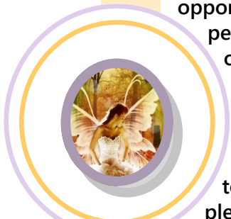
Blessing In Disguise

Blessing in Disguise creates a positive focus on enabling freedom to enjoy treasured memories to share with family and loved ones and provides a range of life enhancing experiences helping to improve the quality of life for children and young people with disabilities or life limiting illnesses.