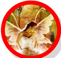
Blessing In Disguise

Blessing in Disguise creates a positive focus on enabling freedom to enjoy treasured memories to share with family and loved ones and provides a range of life enhancing experiences helping to improve the quality of life for children and young people with disabilities or life limiting illnesses.